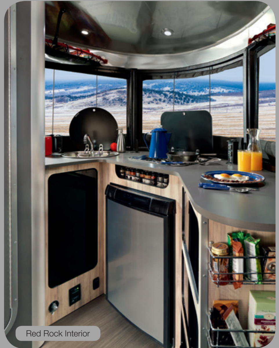
Red Rock Interior

The 2018 Airstream Basecamp is a sturdy, hypnotically beautiful escape pod packed with everything you need to live in complete comfort – whether you're off the grid, at a family campground or in a friend's backyard.