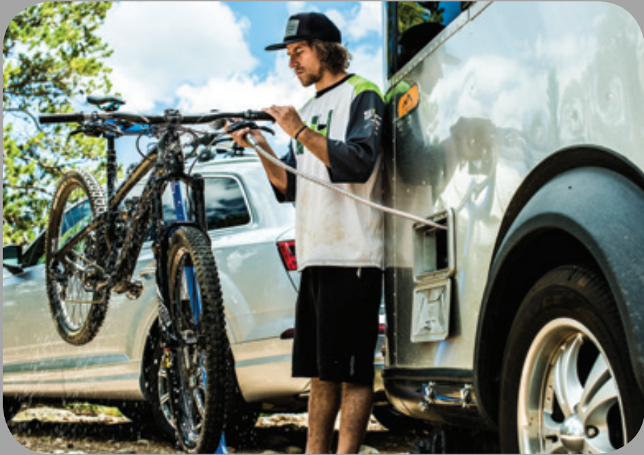
The pass through water access makes a handy unisex/unisport outdoor shower.