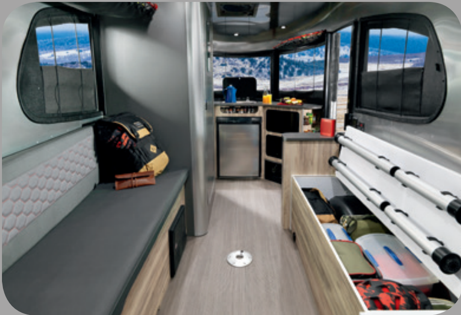
Bench storage – 11.5 cubic feet