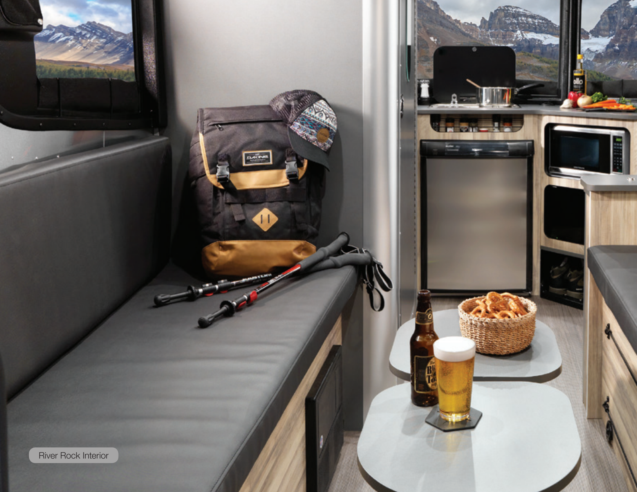
River Rock Interior