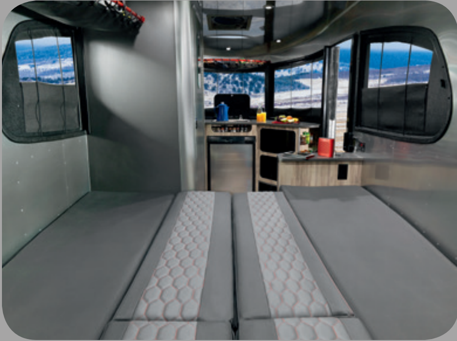
Full bed sleeping option – 76 in. x 76 in.